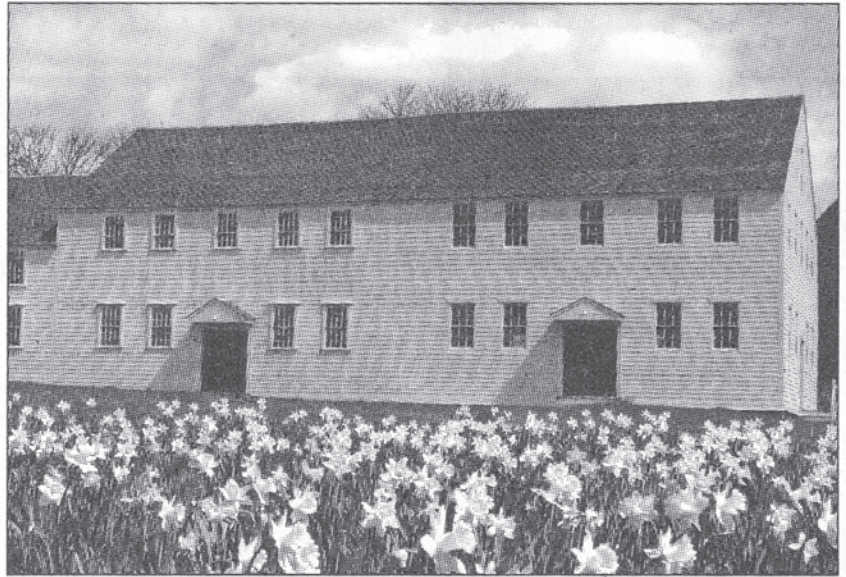
Great Friends Meeting House in Newport is the place to sample the suds from 30 New England breweries on Saturday, April 28.

Guests will be given the opportunity to try small samples of all manner of craft brews. The list includes Blue Hills Brewery, Trinity Brewhouse, Union Station Brewery, Mayflower Brewing Co., Cape Ann Brewing, Goose Island Beer, Harpoon Brewery, Sabago Brewing Company, and, of course, Newport Storm.